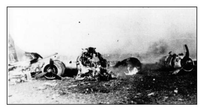
There was not a lot left of poor "Queenie" after crash landing at Paderborn April 13, 1945. Joe and the Traeder Crew were lucky to survive that one!

The tight formation, which served to protect the fleet during runs, now proved calamitous. Six planes were taken out, including Queenie, which lost two of its four engines in the explosion and was careening toward a crash landing behind enemy lines. An airfield spotted in the distance seemed the crew's only salvation, but it proved too far for the rapidly